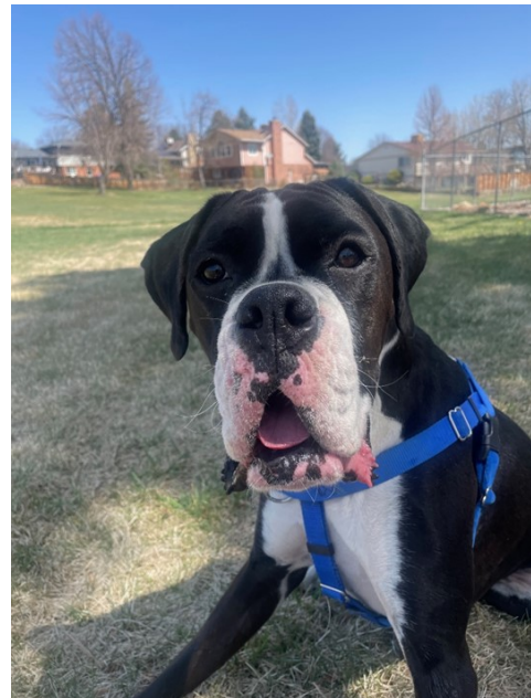
Buster the Boxer